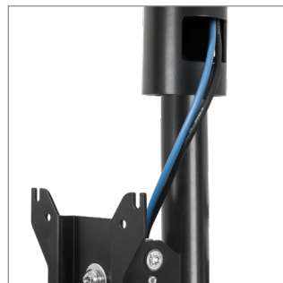
Integrated cable management for a neat and tidy installation