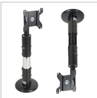
Ideal for mounting screens from the ceiling, floor or desktop